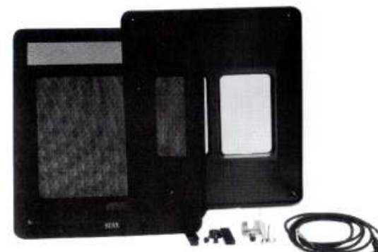
Optional EKC-4U/II panel with a slope-away baffle for minimum edge diffraction

● The STAX EK-1/MK-2 — the world's first and only kit electrostatic loudspeaker — offers you hundreds of design possibilities. By mounting the EK-1/MK-2 components on a simple baffle board of your own work, you'll be the owner of one and only high-performance electrostatic speaker system featuring purely transparent, superbly defined music recreation. If you are too busy to work at a baffle board, you can set up the EK-1/MK-2 onto the STAX EKC-4U/II special baffle board to produce a compact electrostatic speaker almost equal to our ESTA 4u Extra Self-Polarizing Compact Electrostatic Loudspeaker System. Furthermore, the EK-1/MK-2 can grow into a greater system by stacking additional sound elements optionally available. The EK-1/MK-2 is also capable of playing the leading part as a seamless high-and midrange driver in a bi-amplifier system. All in all the EK-1/MK-2 provides a very affordable way to experience genuine electrostatic sound with natural perspective and freedom from tonal coloration.